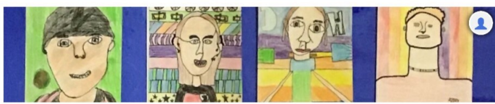
Edney Art Room