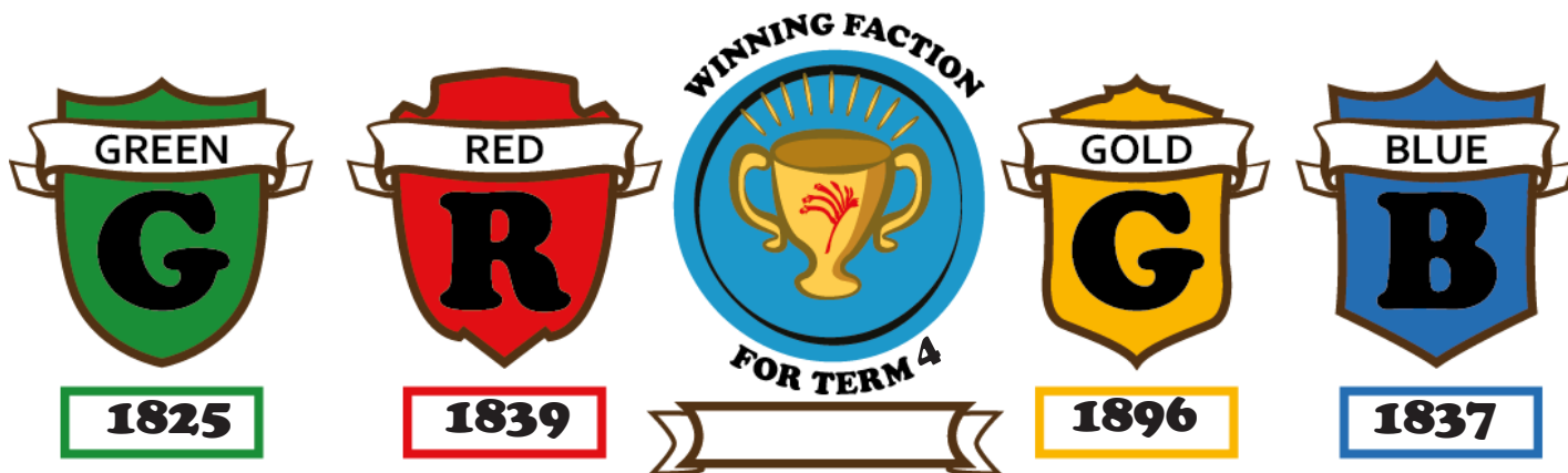
>>Faction points as of Term 4 Week 6, 2018<<