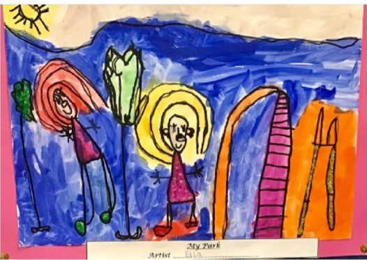
Mrs Mitchell and her students in EC 5 created spectacular artworks depicting their own special park. The process involved drawing, tracing, painting and applying glitter to selected parts of their artwork. These were well worth the hard work, they look amazing. Well done, EC 5